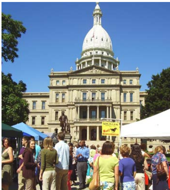
Customers flocked to the Capitol lawn on July 12 to sample and buy Michigan agricultural products and meet local farmers on "Buy Local Day."

At last year's "Buy Fresh, Buy Local - Select Michigan Day" on the Capitol lawn, several vendors sold out or had