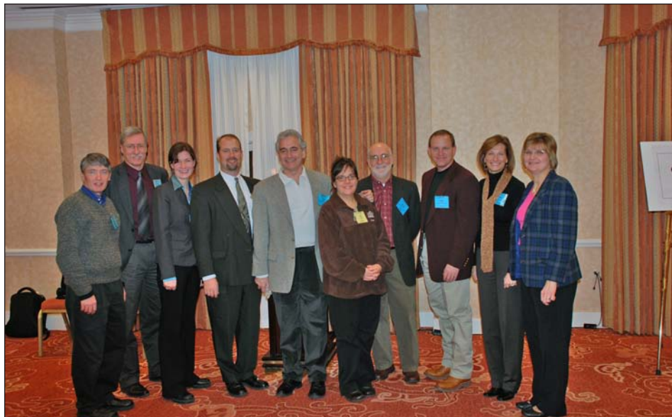
The Michigan Value Chain Partners gather together to celebrate success at the end of the “Meet the Buyers Reception.”